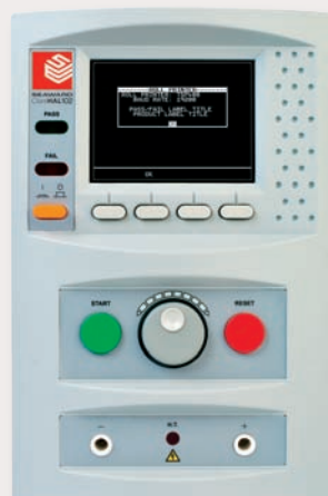
Clare HAL 102 AC/DC Hipot and DC Insulation Tester with built-in scanner switching matrix Part No: H102