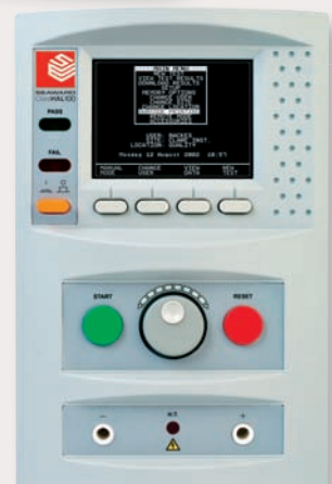
Clare HAL 100 40A Ground/Earth Bond Tester Part No: H100