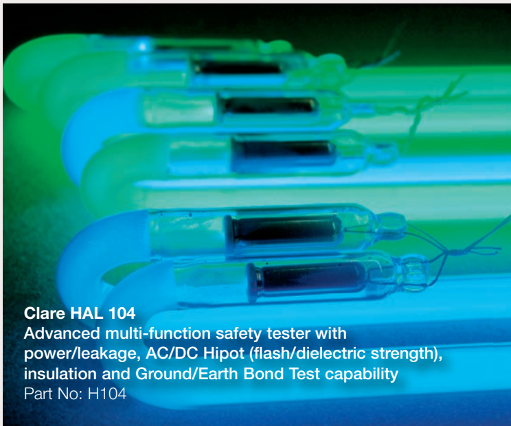
Clare HAL 104 Advanced multi-function safety tester with power/leakage, AC/DC Hipot (flash/dielectric strength), insulation and Ground/Earth Bond Test capability Part No: H104