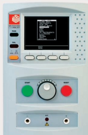
Clare HAL 101 AC/DC Hipot and DC Insulation Tester Part No: H101